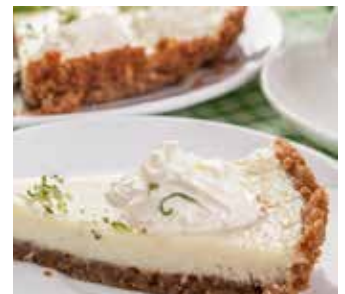
Key Lime Pie Pepe's Café