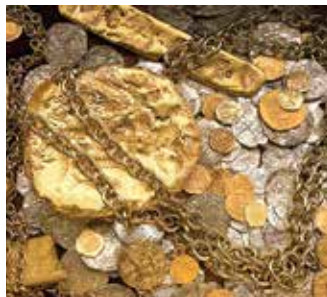
Mel Fisher Maritime Museum