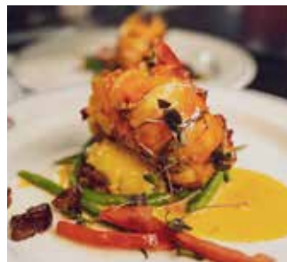
Butter Poached Lobster Tail A&B Lobster House