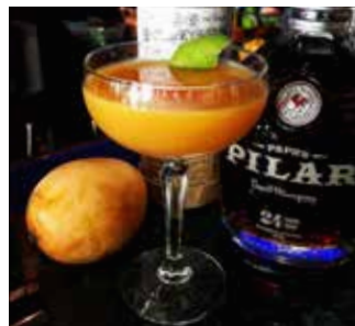
The New Hemingway Daiquiri The Roost

Please plan to make your reservations prior to arrival.