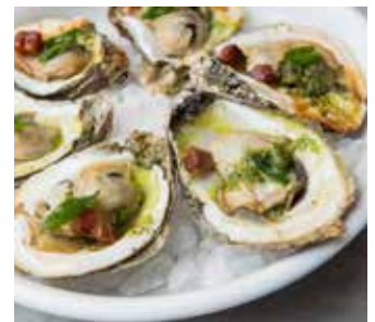
Oysters Rockefeller Thirsty Mermaid