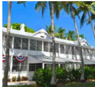
Truman Little White House

Key West is famous for being the southernmost city in the continental United States. When you visit, it's essential that you make it to the southernmost point on the island, found at the intersection of Whitehead Street and South Street. Here, you'll see the landmark Southernmost Buoy (a required photo opp) and a whole host of other "southernmost" attractions that make for a fun Key West afternoon.