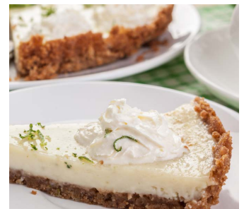
Key Lime Pie Pepe's Café