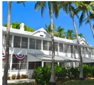
Truman Little White House

Key West is famous for being the southernmost city in the continental United States. When you visit, it's essential that you make it to the southernmost point on the island, found at the intersection of Whitehead Street and South Street. Here, you'll see the landmark Southernmost Buoy (a required photo opp) and a whole host of other "southernmost" attractions that make for a fun Key West afternoon.