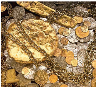
Mel Fisher Maritime Museum