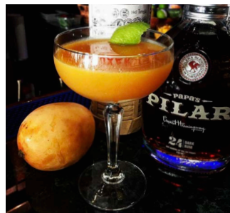
The New Hemingway Daiquiri The Roost

Please plan to make your reservations prior to arrival.