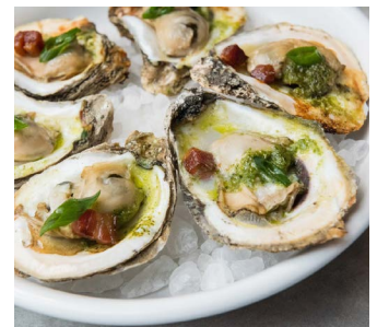
Oysters Rockefeller Thirsty Mermaid