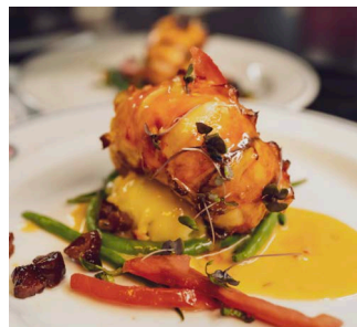
Butter Poached Lobster Tail A&B Lobster House